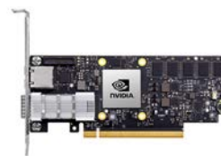
BlueField-2 DPU - 1x 200Gb/s HHHL form factor