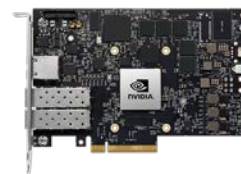
BlueField-2 DPU - 2x 25Gb/s HHHL form factor