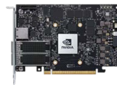
BlueField-2 DPU - 2x 100Gb/s FHHL form factor