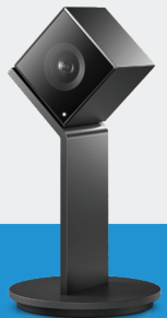
HP Presence See 4K AI Camera 14