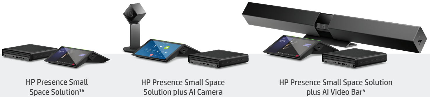
HP Presence Small Space Solution 16