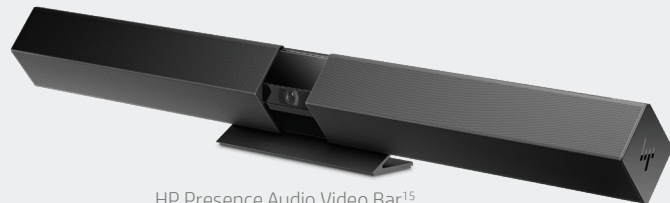
HP Presence Audio Video Bar 15

WORLD'S FIRST conferencing solution smart camera with an automatic sensor-driven privacy shutter. 7