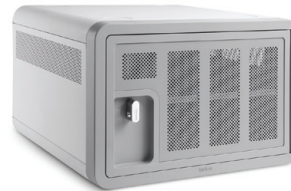
Secure and Charge B2B117

Applications: Dental Offices, Medical Facility Offices, Office Work Space