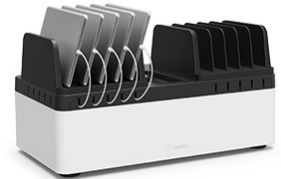
Store and Charge Go Fixed Dividers B2B141