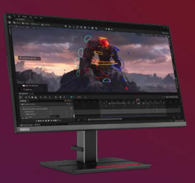
ThinkVision Creator Extreme 27" 4K UHD Monitor