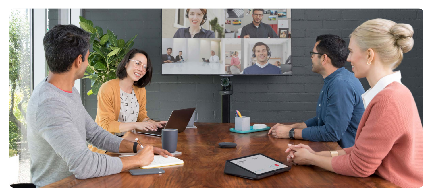
Deliver one-touch join, calendar integration, easy content-sharing, and a consistent experience across all rooms.