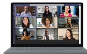
Teams Video Conference with AI Experiences

UP TO 83% FASTER 13 (AMD Ryzen™ 7 PRO 7840U compared to Qualcomm SQ3 processor)