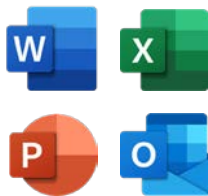
MS Office Apps