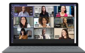
Teams Video Conference