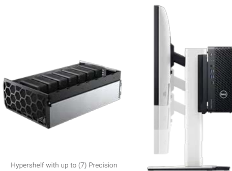
Hypershelf with up to (7) Precision 3280 CFF in a 5U rack space

Take your ideas to new places with a workstation that matches your skills but doesn't break the bank. Available in compact, small form factor, and a tower design, they are great for space-constrained workspaces, as well as some Edge use cases. These workstations are optimal for financial, design, creative applications, and many more.