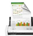
ADS-1250w with Duplex and Wireless Networking