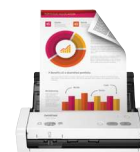
ADS-1200 with Duplex