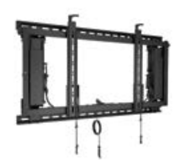
LVS1U 42 - 80" Landscape Mount with Rails

ConnexSys can also be ordered with individual rails for each mount - ready to install right out of the box. Rail models are available in both portrait and landscape orientations.