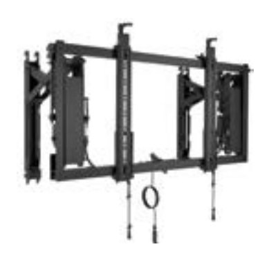
LVSXU 42 - 80" Landscape Mount without Rails